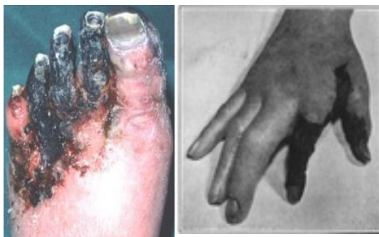
Figure 2 Dry gangrene of the foot and hand

lysergic acid (ergoline) moiety, and other alkaloids of the ergoline group that are biosynthesized by the fungus. (7)